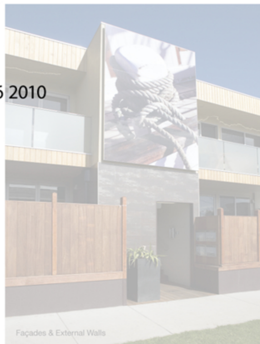
Façades & External Walls